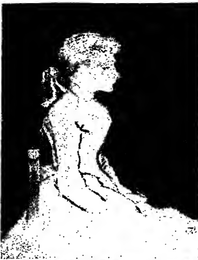
Van Gogh's "Adeline Ravoux" was auctioned for $13.75 million.